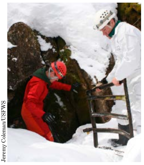
Vermont Fish and Wildlife Department biologists remove the gate to conduct a winter survey at Plymouth Cave

Bats with WNS act strangely during cold winter months, including flying outside during the day and clustering near the entrances of caves and other hibernation areas. Bats have been found sick and dying in unprecedented numbers in and around caves and mines. WNS has killed more than 5.5 million bats in the Northeast and Canada. In some areas, 90 to 100 percent of bats have died.