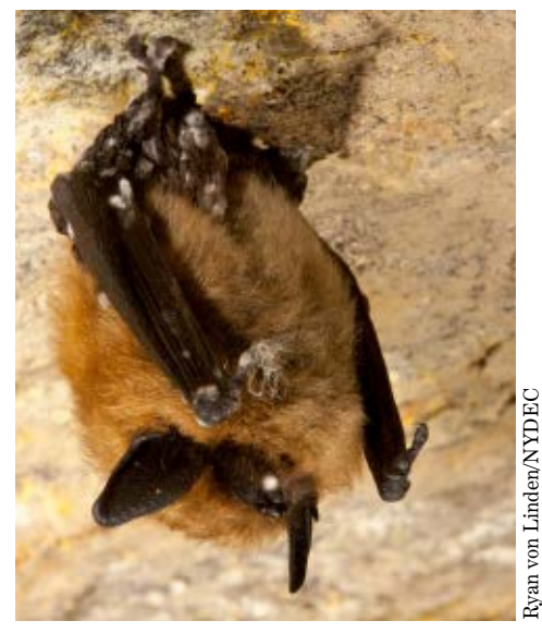
Eastern small-footed bat with white fungus on nose, arms, and wings

Federally listed species found in the affected area that have not yet been confirmed with WNS or fungal